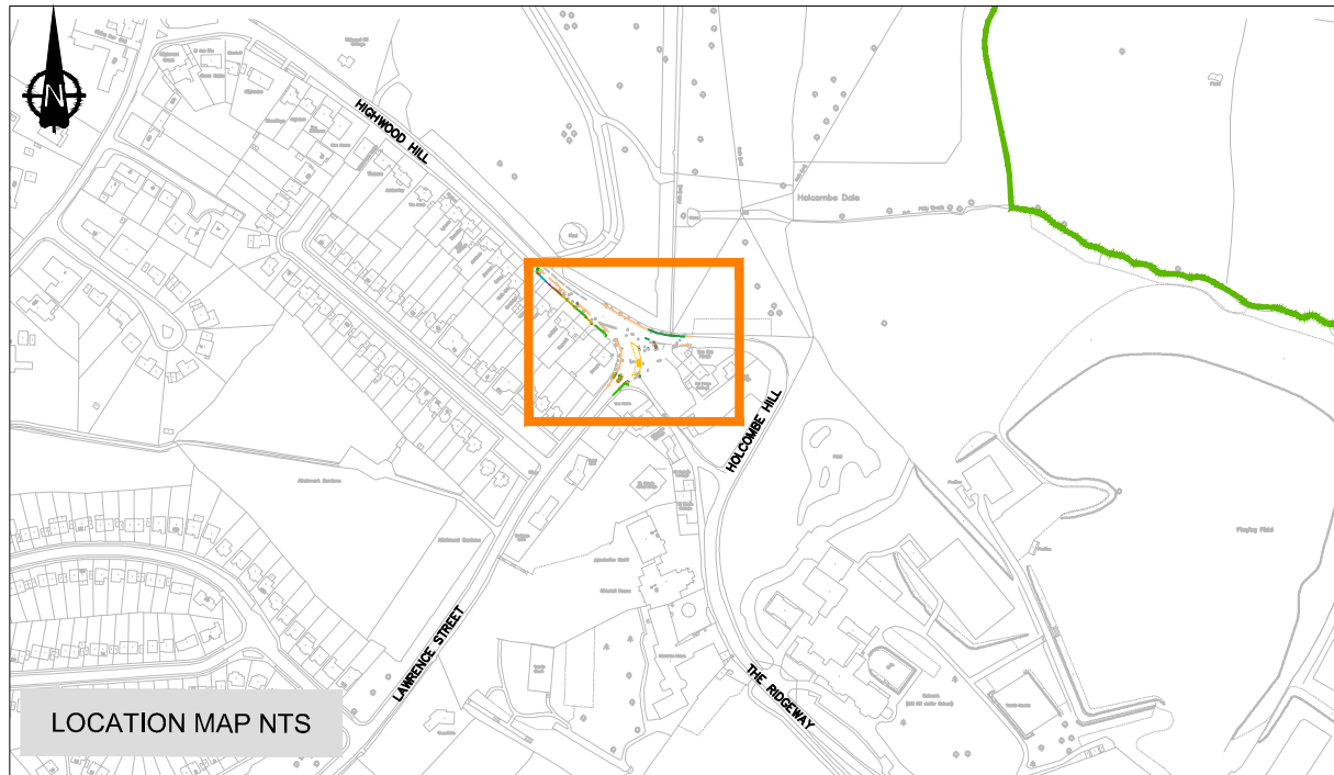
LOCATION MAP NTS